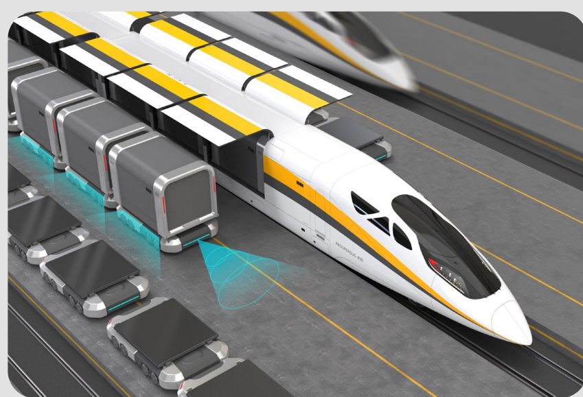
Based on the future city - Intelligent Freight high speed railway logistics system