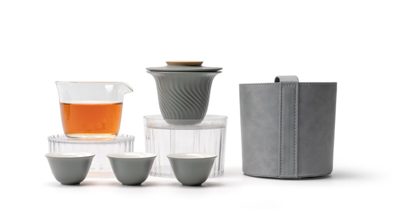
ET360 White Portable Tea Maker