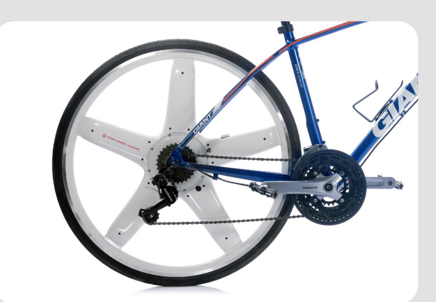
Intelligent power wheel