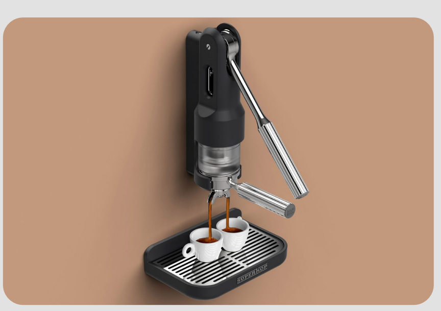
SUPERKOP espresso maker