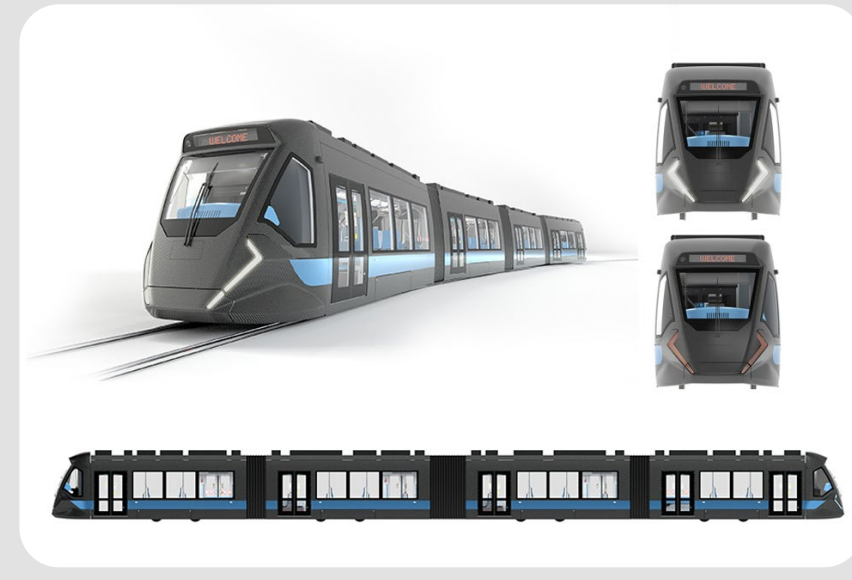
New-catenary-less power supply for urban rail trains