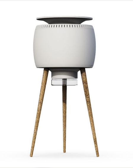
From Locust to Nutrition