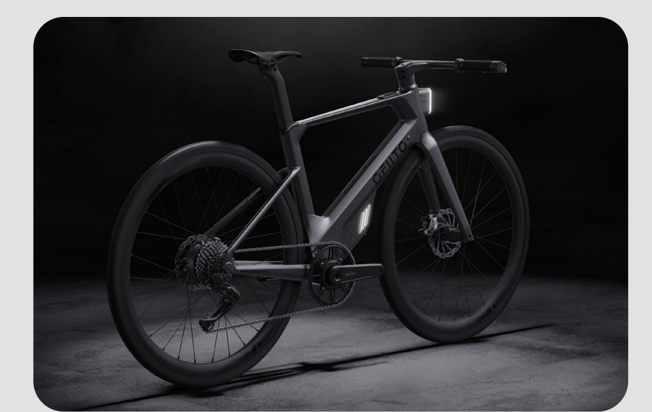
OFIITO - urban racer R3