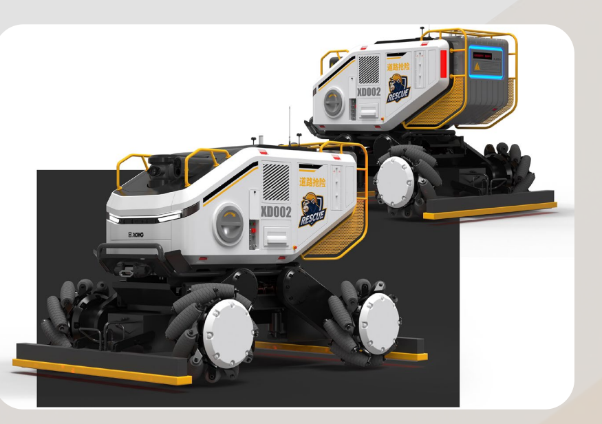
"Tianjiang" 2.0 modular road emergency rescue equipment system