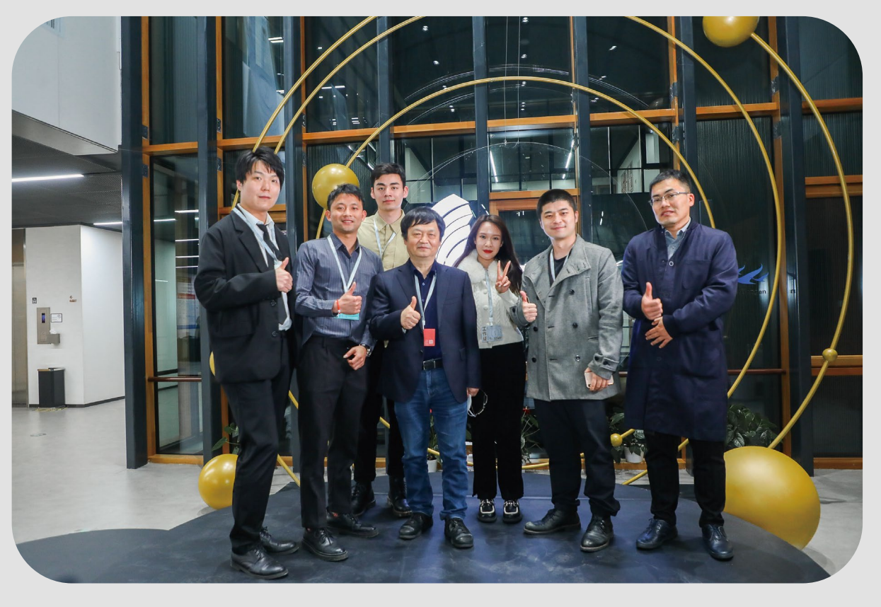
Award Ceremony of The Third Goldreed Industrial Design Award