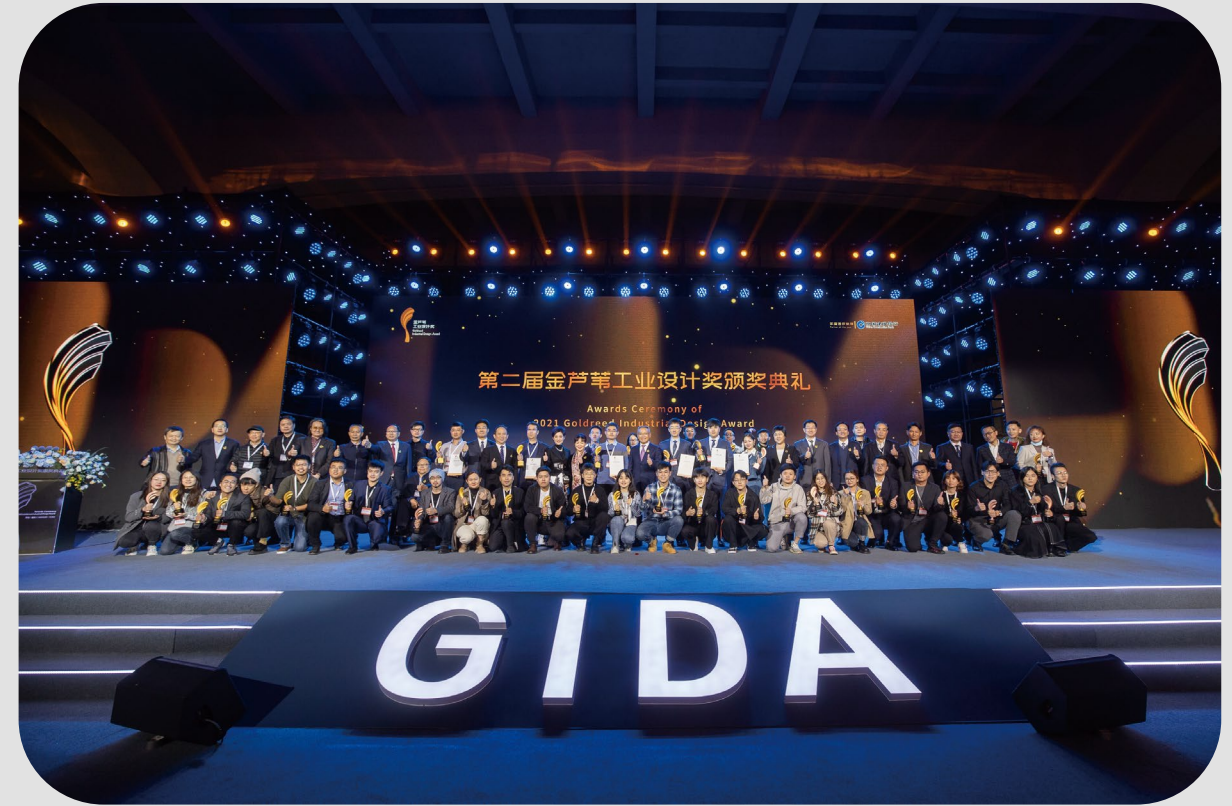
Award Ceremony of The Second Goldreed Industrial Design Award