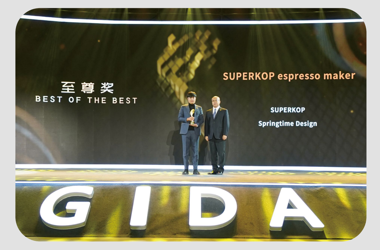
Award Ceremony of The Third Goldreed Industrial Design Award