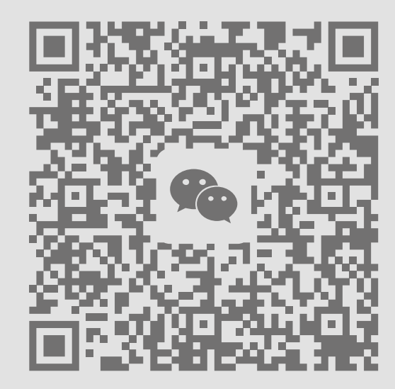
WECHAT customer service