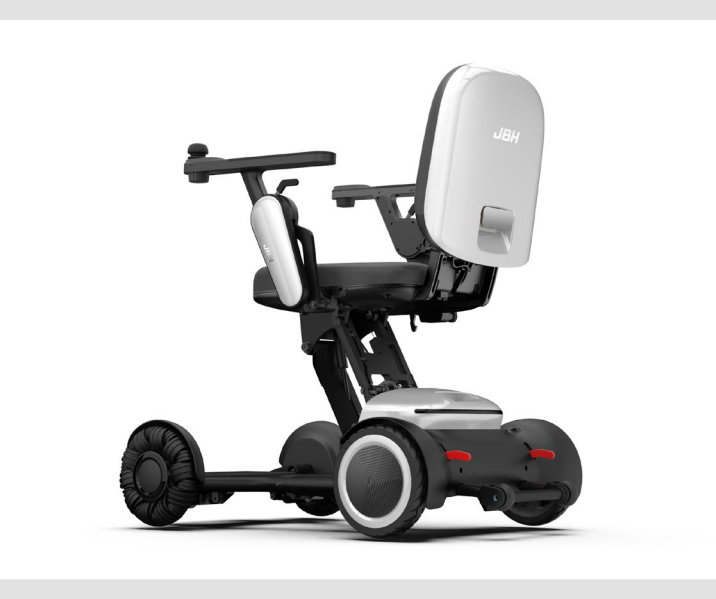
FN-C1 Carbon Lite E-foldable Wheelchair