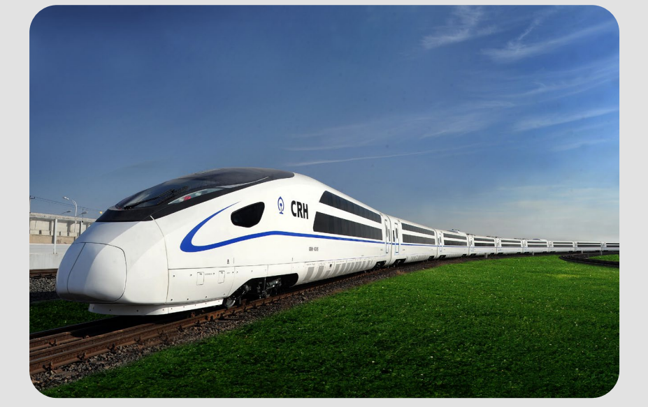
New high-privacy and large-capacity forward layout sleeper EMU