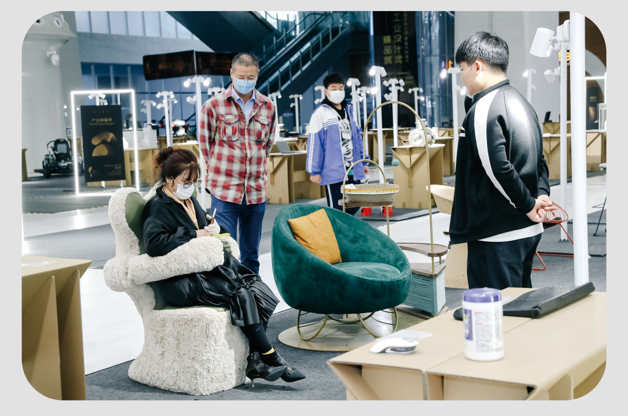
The Second Goldreed Industrial Design Award Good Design Exhibition