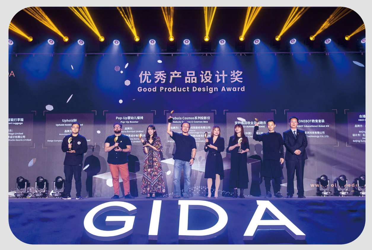
Award Ceremony of The First Goldreed Industrial Design Award