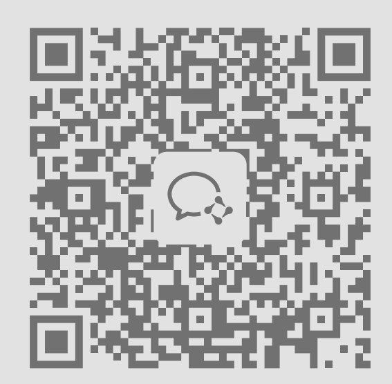
Participant Exchange Group