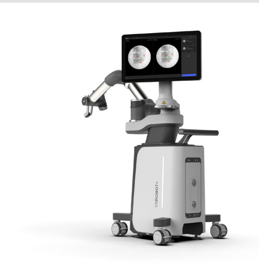
NS100 Orthopedic Robotic Surgery Platform