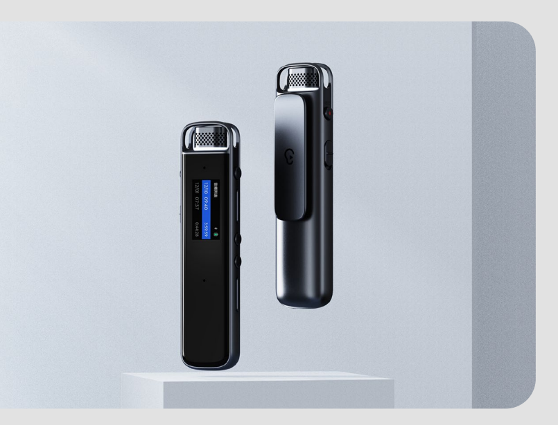
iFLYTEK Smart Recording Pen H1Pro