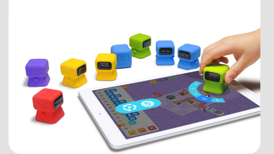
Tangiplay Coding Kits