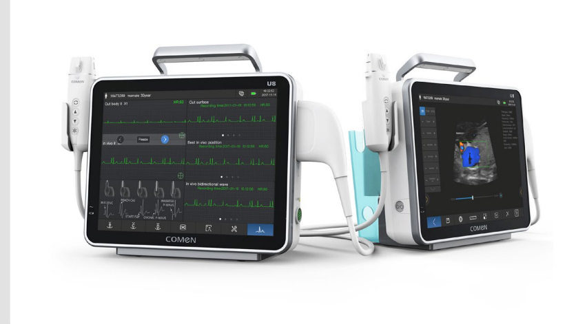
Multifunctional Catheter-positioning Guiding System