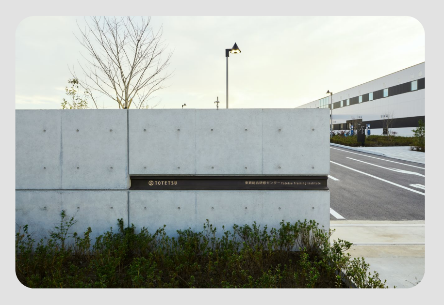
TOTETSU Training Institute