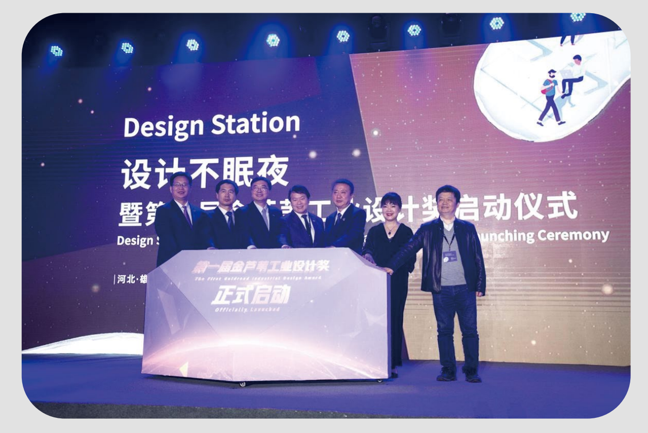
The First Goldreed Industrial Design Award Launching Ceremony